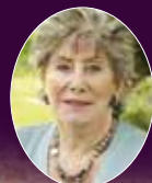
Valerie Singleton Former Blue Peter presenter